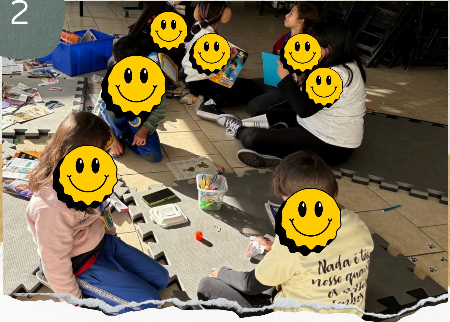
Spread the magazines and let them select the proper pictures for their professions.